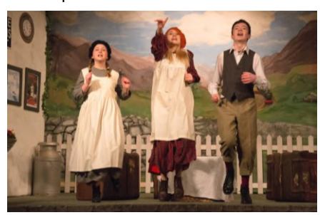
Scenes from two recent productions by the Castle Players Amateur Dramatic Society: The Railway Children, above, and The Crucible, below

Castle Players Amateur Dramatic Society was formed in 1987. From small beginnings the group has gone from strength to strength and, most importantly, has played a key role within the local community, bringing drama to a variety of events. Community projects include running the 'Hot Chestnut and Mulled Wine' stall at Beaumaris's Victorian Christmas Event, Poetry Readings at Beaumaris Food Festival, Drama at Beaumaris Festival Fringe, Hallowe'en Drama at Beaumaris Gaol, Dramatised Trials at Beaumaris Courthouse, and Street Theatre in White Lion Square.