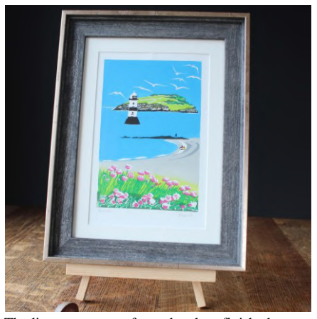
The linocut process, from sketch to finished article...and front cover! (Pat Mowll)