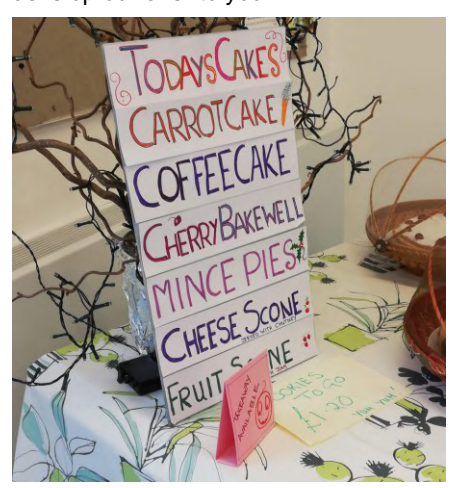
Caffi Ni, Neuadd Bentref Llanddona Village Hall: a sampler...

If you want something to take place at the Canolfan and there are others that think the same we will do all that we can to make it happen...we are here for the residents of the Seiriol area and keen to develop our offer to you.