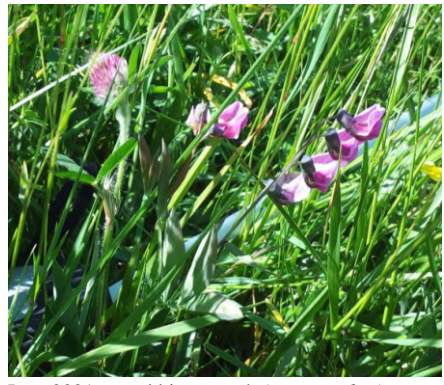
June 2021: wood bitter-vetch (Vicia orobus), a once-common meadowland flower. Wales is a global stronghold of the world population of this species though overgrazing and undergrazing has lead to declines

Woodlands, hedgerows and dry-stone walls are important features in farm and hill landscapes and all have potential value for wildlife. Worldwide, woodlands and forests have huge importance for the climate as they utilise great quantities of carbon dioxide and produce oxygen during photosynthesis. They also protect soils and reduce the risk of soil erosion and devastating landslides. Only about 13% of the UK has woodland cover, and only half of this is comprised of native tree species, so there is great scope for improving this, partly by providing better incentives for farmers.