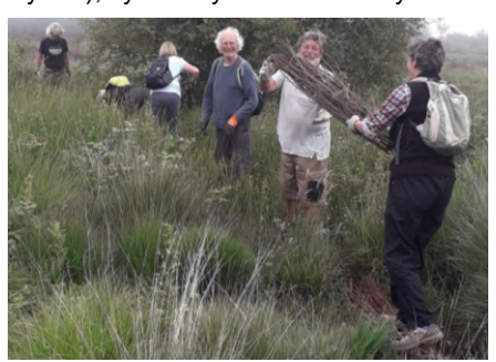
Gwaith tîm gwirfoddol ar waith yn Rhos Llaniestyn/volunteer teamwork in action at Rhos Llaniestyn