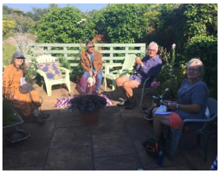
Llanddona Writing Group taking in the late-July sun...

writing between us: memoirs, poems, short stories, blogs, articles, and even novels!