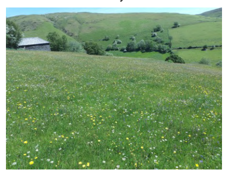
June 2021: Rhos yr Hafod SSSI is located on the hillside to the north of Penygarreg Dam in the Elan Valley. It is an outstanding example of herbrich hay meadow and pasture land in which a number of uncommon plant species are very well represented

Afon Ogwen was severely dredged and deepened in the 1970s in an effort to improve adjacent peaty pastures in Nant Ffrancon, but in more recent years the National Trust has encouraged recovery to a more natural river profile and associated biodiversity.