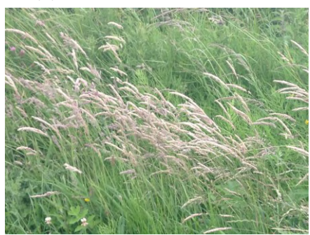
Walk barefoot through the meadow of wildflowers And feel the grass as it blows

After some fine, dry weather in late April, the month of May was a disappointment for most of us: cold and wet. Wales was reported to have had its wettest May for many years.