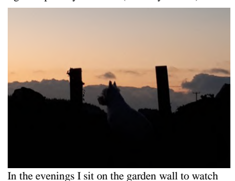
the ponies galloping about... (via Tilly Barker)