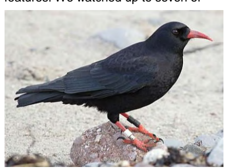
Compare and contrast...a ringed chough, above and a jackdaw, below; the head and beak are quite different.

Over the last winter we regularly heard the distinctive call of the chough on our morning walk. The call is similar to that of a jackdaw, but if you're lucky enough to see the bird as well as hear it the shape of the wings and the curved orange beak are key identification features. We watched up to seven of