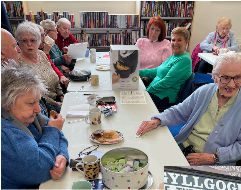
Clockwise from top left: